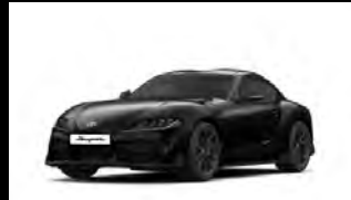
BLACK METALLIC أسود معدني