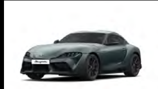
MATTE STORM GRAY METALLIC رمادي مطفي معدني