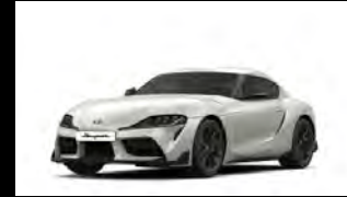
WHITE METALLIC أبيض معدني