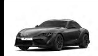
VOLCANIC ASH GRAY METALLIC رمادي الرماد البركاني المعدني