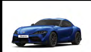
DAWN BLUE أزرق داكن معدني