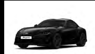
MATTE STEALTH BLACK أسود مطفي