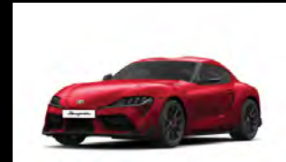
PROMINENCE RED أحمر فاضح