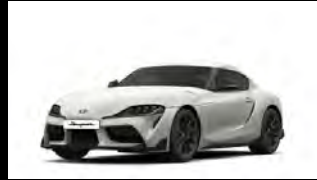
MATTE AVALANCHE WHITE ME. أبيض جليدي مطفي