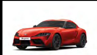
PLASMA ORANGE برتقالي بلازما